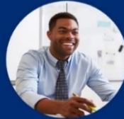
Student Teachers & Interns